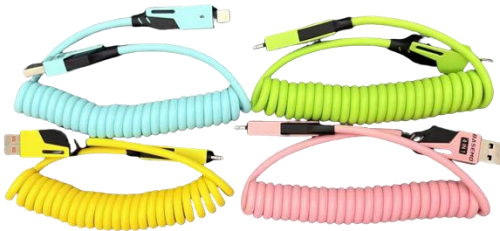
K8387CHS Spring Retractable Charging Data Cable, Lightning, Micro USB-A, Type-C 4-in-1, PD65W, Pink/Blue/Green/Yellow Cable Selection 480mbps, Length: 150cm