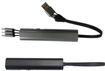
K8387CDE 2-in-3 Retractable Charging Data Cable, Type-C/USB-A to Type-c/Lightning/Micro, Metal Case, PD60W, Length 28cm