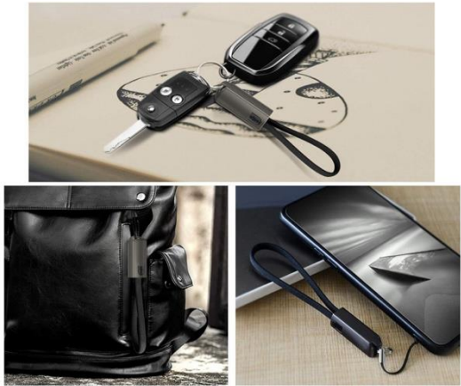
Multi-function Keychain Design You can use it as a keychain, or carry on your bag, phone case, allowing easy access wherever you go.