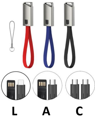
K8387CDB Keychain Charging Data Cable, Metal Case, With Lanyard, (C) Type-C to Type-C 60W, (A) USB-A to Type-C 30W, (L) USB-A to Lightning 10W, Red/Blue/Black Cable Options, Length 16cm